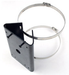
Pole Mount Installation Bracket